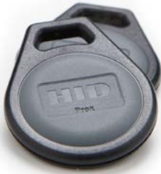
1346 PROXKEY III® FOR CORDLESS ARMING/DISARMING